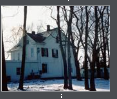
First Graduate Center, Reston